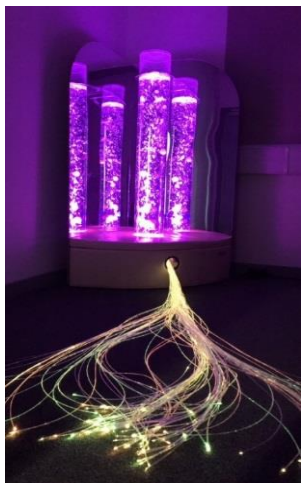
A designated sensory area to enable delivery of a sensory curriculum.

Aberdeenshire council are committed to providing the right support, in the right place, at the right time. In all schools across Aberdeenshire the Staged Intervention Process is used to assess needs and identify the required support. The least intrusive method of intervention is always implemented at first. All our children have access to universal support within their educational establishments. Targeted support is needed by some children and young people experiencing short or long term additional support needs. This targeted support is provided within schools (PSAs, ASL Teacher, CLD, PSW, I&PT) and from other partner agencies (Health, Social Work, Community Agencies). However, some children require an enhanced level of provision in addition to mainstream education to meet complex additional support needs. Within the Turriff cluster Turriff Academy and Turriff primary school are designated enhanced provision centres where a specialist level of intervention is available either on a part-time, full-time or outreach basis. Currently in our enhanced provision we have pupils accessing full-time, blended and outreach support. This means that our children and young people are able to access a flexible, inclusive support structure accessing both mainstream and targeted specialist support.