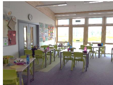
In class support and outreach with class teachers to develop capacity and confidence with staff.