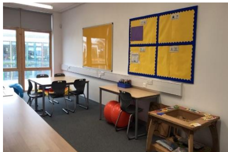
A quiet area for use by children who need space for time alone, keep safe or to work with an adult or in a small group.