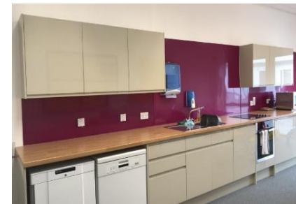
A nurturing room with a life skills area in order to promote the learning of social and independence skills.